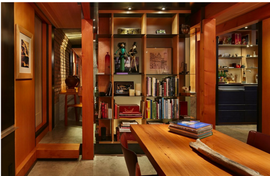
This lower-level steel-shelved bookcase frames a bathroom behind its translucent glass back. The fully stocked and equipped butlers pantry/kitchen/bar is at right.