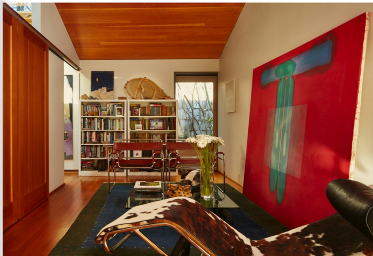
A 1990s Gabbeh rug grounds Swain's extra-convertible study, filled with pieces he's been "slowly collecting," such as a 1927 Le Corbusier lounge chair, leather Wassily chairs and a 1967 Guy Aulenti coffee table (outfitted with tail wheels from small airplanes). Swain once designed the interior of a private Boeing 737 and held meetings here to divine inspiration from the space.

Sandy Deneau Dunham writes about architecture and design for Pacific NW magazine. Benjamin Benschneider is a magazine staff photographer.