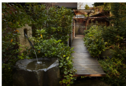
Western red cedar planks lead past a stone basin water feature to the entrances of two of the home's three separate living areas.