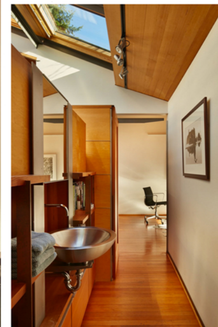
The more-public sink, cabinetry and enclosed toilet section of the bathroom in Swain's "back house" acts as a corridor to an indoor-outdoor shower and a private deck. "I don't like normal bathrooms," Swain says. "This feels like I'm in the woods."