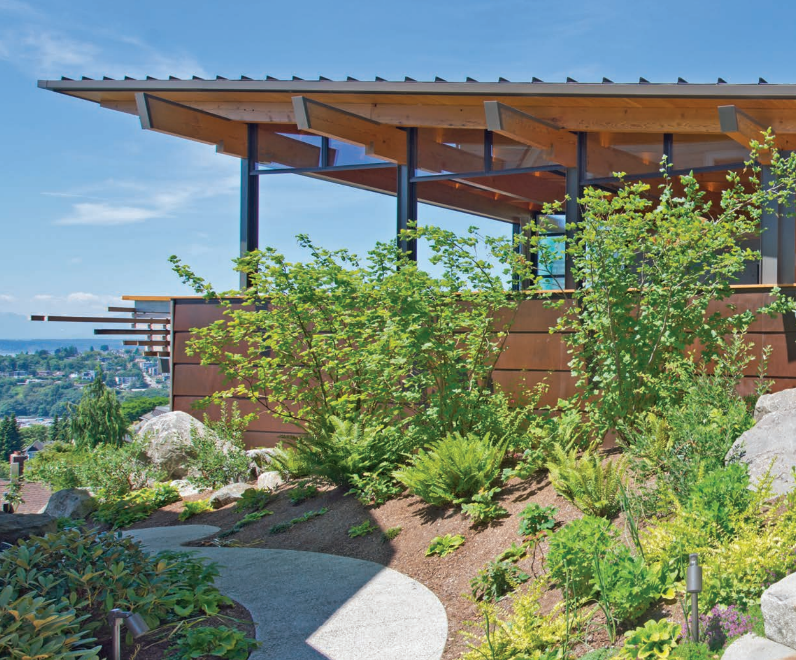
Queen Anne Pavilion, Seattle | Builder: Krekow Jennings | Metal Fabrication: Architectural Elements